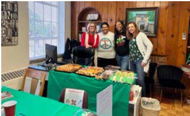
Lily B. leadership team preparing for a Christmas staff event

The Lily B. faculty is outstanding. My responsibility as a leader is to ensure we maintain great teaching and support staff. Once an individual becomes part of our Lily B. team very few leave. When we do have vacancies, I consider an applicant's passion for education a deciding factor. Our teachers and staff are open to learning themselves, adapting,