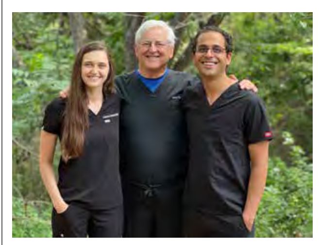
Quality dentistry in your neighborhood

We provide all general dentistry services, including routine dental hygiene, fillings, crowns, whitening, implants, dentures, pediatric dentistry, clear aligner orthodontics, root canals, extractions, sedation dentistry, and more!